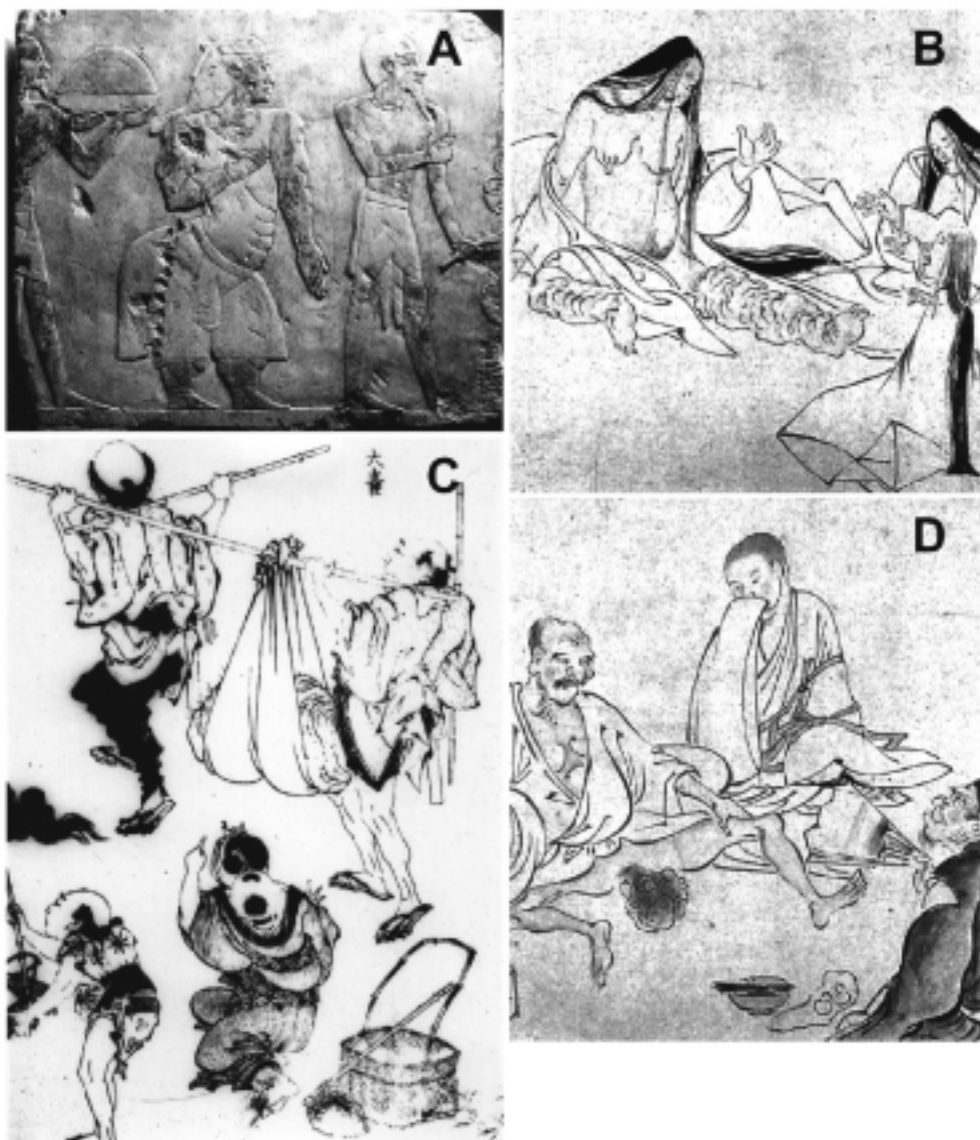
Fig. 1 Chronic symptoms of lymphatic filariasis

A: An Egyptian relief from Queen Hatshepsut's temple, Luxor, depicting the Princess of Punt, a possible elephantiasis case. (The Queen's reign: 1503-1482 B.C.); B and D: Elephantiasis of the legs and scrotum, described some 1,000 years ago in "Strange Diseases Picture Scroll." (Kyoto National Museum, Japan); C: Huge elephantiasis of the scrotum, painted by Hokusai Katsushika (1760-1849). Manga in the Edo era of Japan. {From Ref. [2], courtesy of Prof. Yoshihito Otsuji}