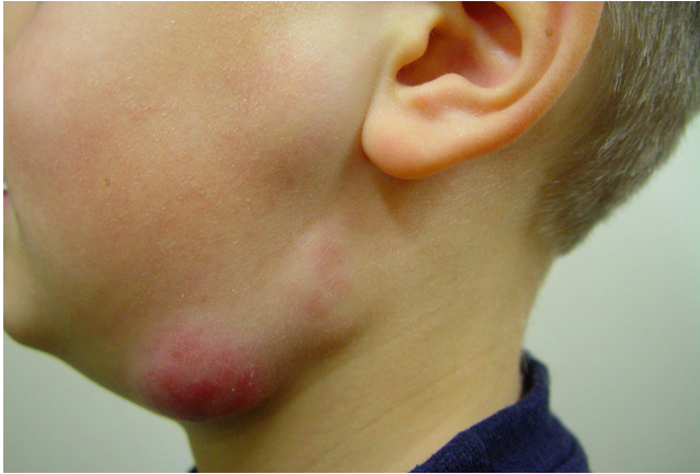
FIG. 2. Clinical picture of a child with a cervicofacial Mycobacterium haemophilum lymphadenitis presenting as a fluctuant swelling with red skin discoloration.