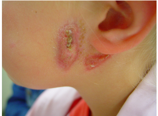
FIG. 3. Clinical picture of Mycobacterium haemophilum lymphadenitis after skin breakdown.

Pulmonary involvement. Armstrong et al. (3) described a 12-month-old male infant with a 6-week history of daily fever, anorexia, and weight loss. Examination revealed fever, cough,