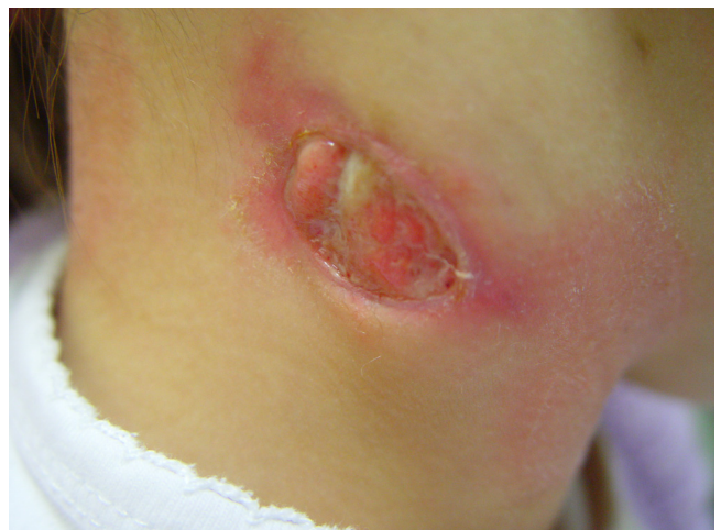
FIG. 4. Ulcerating open wound as a result of a cervicofacial Mycobacterium haemophilum infection.

M. haemophilum infection is not restricted to a human host. M. haemophilum appears to be pathogenic in fish and has caused clinical manifestations in a snake and a bison similar to those seen in humans (63, 69, 74, 154). A royal python was diagnosed with pulmonary mycobacteriosis caused by both M. marinum and M. haemophilum (63). Normal lung tissue was largely replaced by granulomatous tissue containing necrotic foci, as is often observed for mycobacterial disease in humans. Cultures of tissue biopsy specimens contained numerous AFB