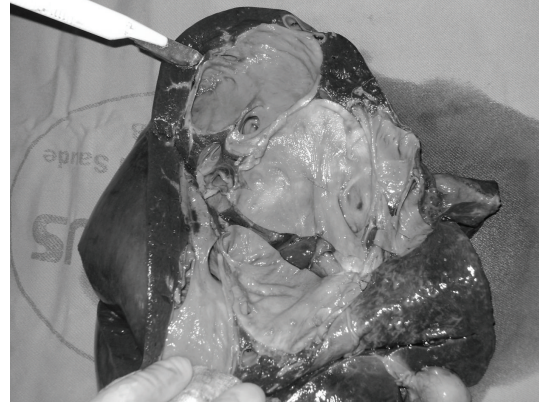
FIGURE 3: Inspection of liver specimen of patient 2 confirmed intrahepatic bile ducts' cystic dilatation.

Case 2. A 19-year-old girl, who was diagnosed with bilobar CD when she was 13 years old, after an episode of cholangitis. Her MELD score was 15. The poor quality of live caused by many jaundice and cholangitis events led to transplantation. She underwent an LDLT and received a right liver graft from her father. The graft's weight was 706 g, corresponding to 1.21% GRWR. Liver specimen confirmed intrahepatic cystic