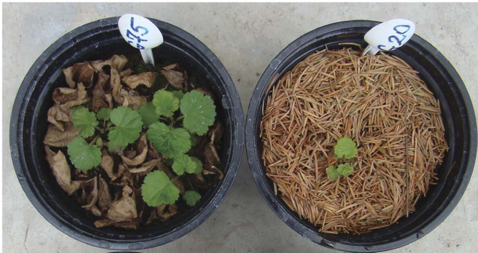
Figure 1. Geum rivale seedlings growing with deep hazel (left) and deep spruce litter (right). doi:10.1371/journal.pone.0026505.g001