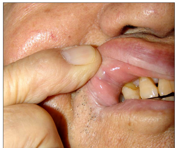
Fig. 1. A normal skin colored subcutaneous nodule measuring 8 mm on the mucosal aspect of the right upper lip.

An 82-year-old man presented to our dermatology department with a subcutaneous nodule on the mucosal aspect of his right upper lip. He noticed the lesion 15 days before the visit and had not taken any treatment for it. Intraoral examination revealed an almost non-tender normal skin colored nodule on the lip, which measured 8-mm, and was covered with normal mucosa (Fig. 1). The