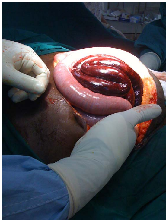
Fig. 2. Small bowel mesentery caught in hernial sac resulting in gangrene of mid-jejunum.

Intestinal maturation starts in the 6 weeks old fetus when the midgut herniates into the umbilical cord. The midgut rotates a full 270° counterclockwise around the superior mesenteric artery by time it re-enters the abdomen. If the prearterial segment rotates but the postarterial segment fails to rotate the small bowel is entrapped in the right mesocolon, and right paraduodenal hernia results. 12 Autopsy specimens showed a sac-like mass with encapsulation at or above the ligament of Treitz, a mass