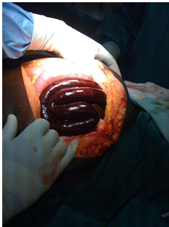
Fig. 3. Multiple loops of gangrenous small bowel.

on the posterior stomach wall, and mesenteric vessel abnormality.