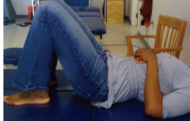
FIGURE 1: Rest position for ADIM.

Participants were excluded if they had a history of surgery in the lumbar spine, radiculopathy, were currently pregnant, had a chronic systemic or connective tissue disease, or had a balance disorder. Participants who believed that they met the advertised inclusion criteria for the nLBP group were