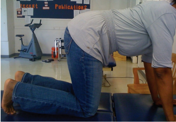
FIGURE 2: Starting position for the quadruped exercise.