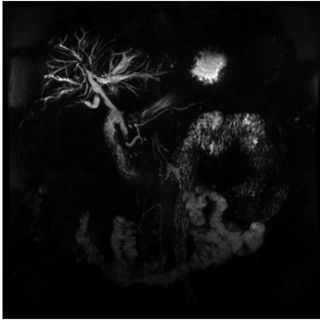
Figure 1 - Cholangio-NMR showing intrahepatic bile-duct strictures that are consistent with a diagnosis of PSC.

tree must be thoroughly examined to achieve a differential diagnosis. 1,2,5 In the past, ERCP and percutaneous cholangiography have been widely used. ERCP is considered the gold-standard diagnostic technique for PSC because the documentation of detailed biliary anatomy that is achieved with this method is informative. However, ERCP is associated with complications, including biliary contamination, cholangitis and pancreatitis. 7 New conservative methods to assess biliary anatomy such as endoscopic ultrasound