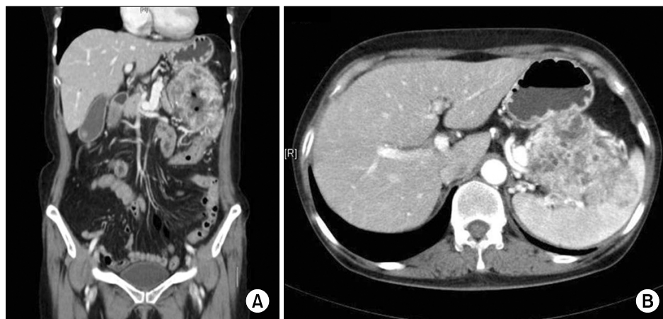
Fig. 1. Computed tomography of the pancreatic tumor. The tumor invaded the transverse colon (A) and spleen (B).

the mass and transverse colon (Fig. 1). The origin of the mass was not determined, but the transverse colon was suspected. Several small nodules in the liver were thought to represent metastases, so a liver magnetic resonance imaging (MRI) was obtained. On the liver MRI, the small nodules in the liver were shown to be benign cysts. There were no specific lesions involving the lung and other organs.