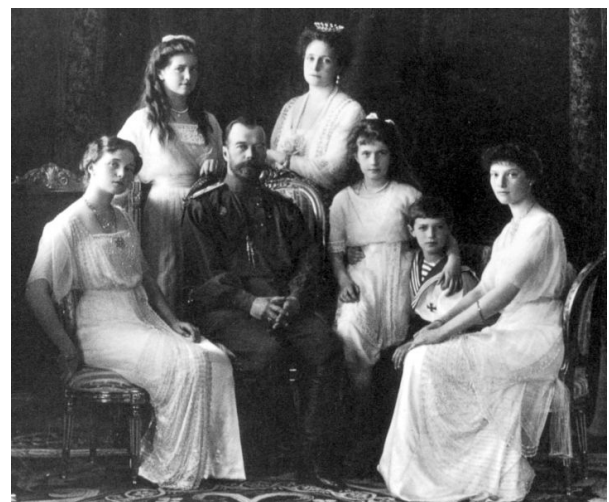
Figure 4 The last Russian imperial family. Left to right: Olga, Maria, Nicholas II, Alexandra Fyodorovna, Anastasia, Alexei and Tatiana.