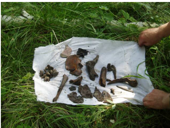
Figure 2 Skeletal remains and archeological artifacts recovered from the 2007 site.

The approach to the DNA testing by Gill et al. [7] was twofold, using autosomal STRs and mtDNA sequencing of the two hypervariable regions (HVI and HVII). STR testing was used as a sorting tool to distinguish each skeleton and show the putative familial relationships among the remains. At the time of the DNA testing, autosomal STR markers were in their infancy. The FSS