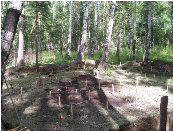
Figure 1 Excavation of the site where three amateur archeologists discovered the remains of the two missing Romanov children in the summer of 2007.