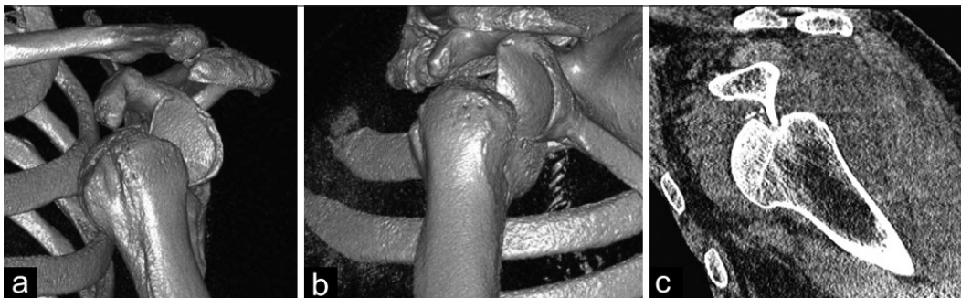
Figure 2(a-c): Assisted computer tomography with three-dimensional reconstruction showing an anterior sub-coracoid dislocated left shoulder with humeral head impacted on antero-inferior rim of glenoid