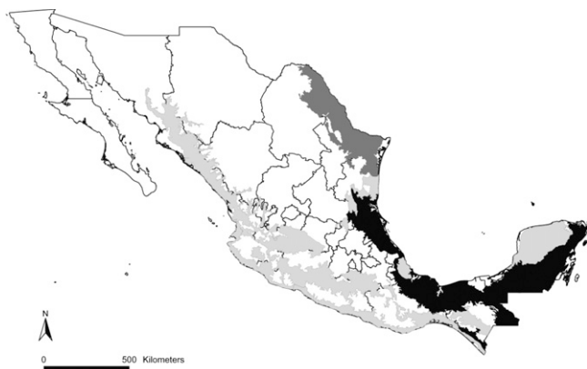
FIGURE 4. Ecoregions where leishmaniasis transmission is known to occur in Mexico. Moist forests are in black, Tamaulipan mezquital is in dark gray, and tropical deciduous forests are in light gray.

In Nayarit, cases have been related to coffee plantations, and recent records of infected patients with Lu. nia mexicana