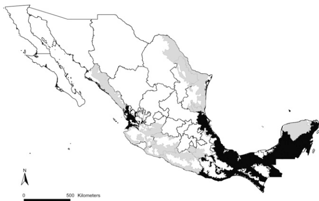
FIGURE 3. Leishmaniasis transmission areas in Mexico. Areas of recurrent transmission are in black, and areas of occasional transmission are in gray.

original vegetation coverage. 10,75 A curious variation occurs in the state of Yucatan, where case incidence is low compared with the rest of the Peninsula, although the known reservoirs are present. The proven vector Lu. olmeca has been reported in this state, although its abundance is low compared with other sand flies in the area (e.g., Lu. cruciata ). It is possible that the number of human cases caused by Lu. o. olmeca is minimal. 75