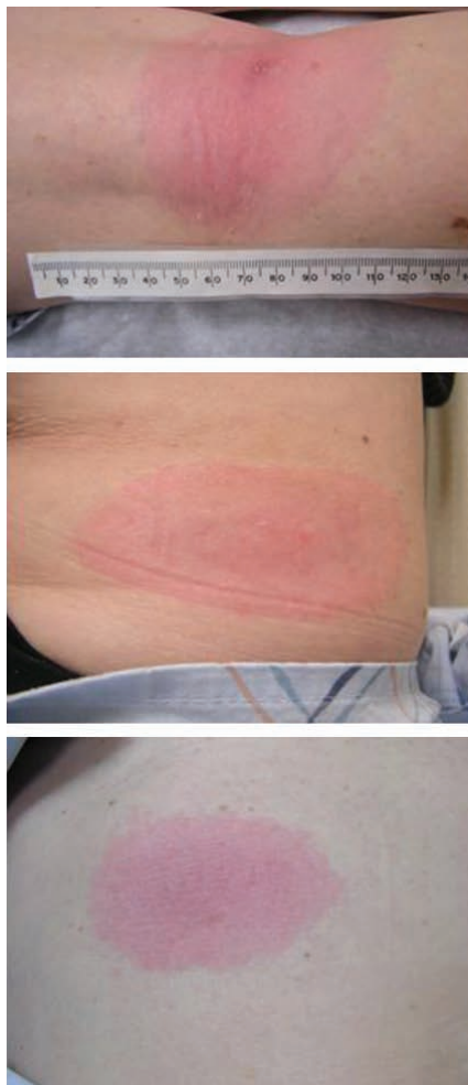
Figure 1. Erythema migrans lesions observed upon physical examination of patient. Primary lesion behind knee (left), along with two disseminated lesions (middle and right).

Because not all cases of influenza have distinguishing symptoms, there is a distinct pos-