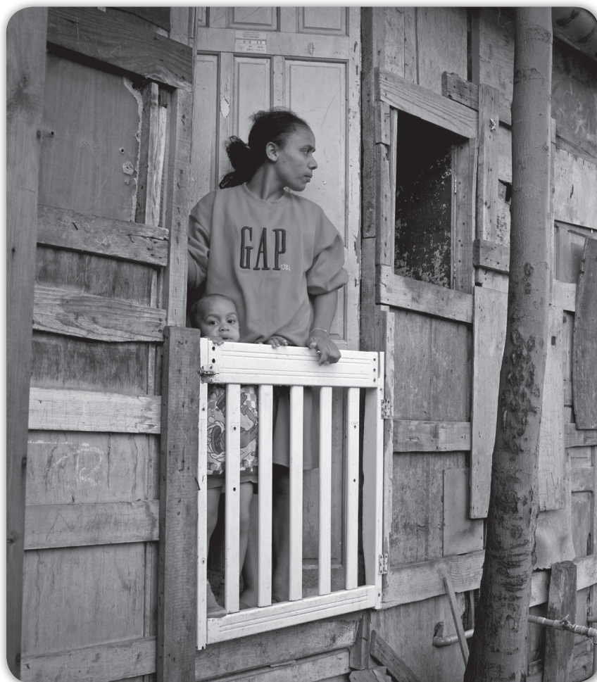
Mother and child in Sao Paulo slums