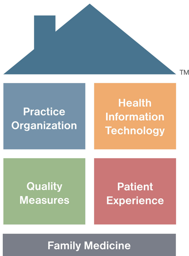
Figure 2 The American Academy of Family Practice model of the Patient-Centered Medical Home.

The American Academy of Family Practice model of the PCMH is shown in Figure 2. PCMH principles were jointly developed by the American Academy of Family Practice, American