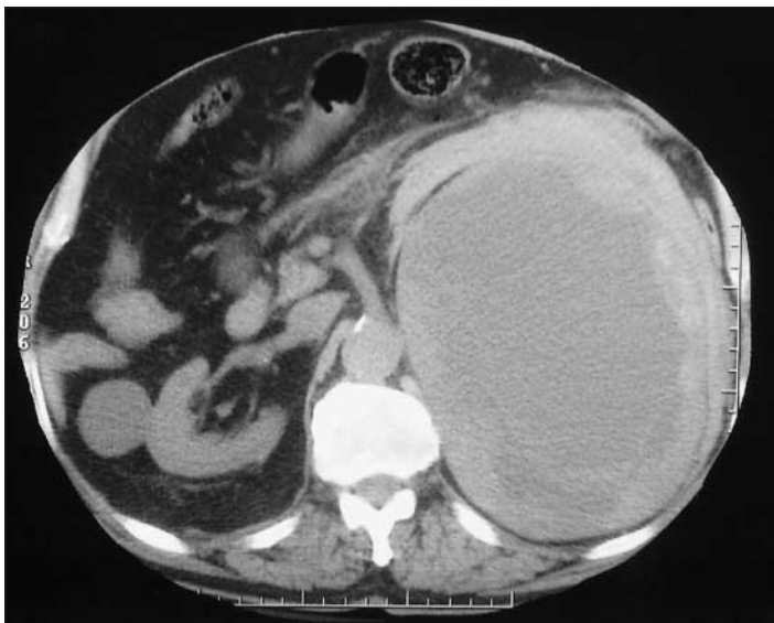
FIG. 1. Computed tomographic scan revealing a large, left-sided retroperitoneal mass.

Pathology revealed a 706-g cystic mass, a cavernous hemangioma 19 × 18 × 8 cm, likely of adrenal origin. Microscopically, the periphery of the tumour consisted of a fibrous capsule encompassing dilated lacunae. The cells lining the lacunae were stained positively by markers for CD31 and CD34, confirming their endothelial origin (Fig. 2). There were no signs of malignancy.