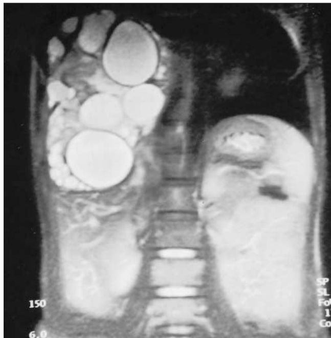
FIG. 5. MRI of a diaphragmatic hydatid cyst.