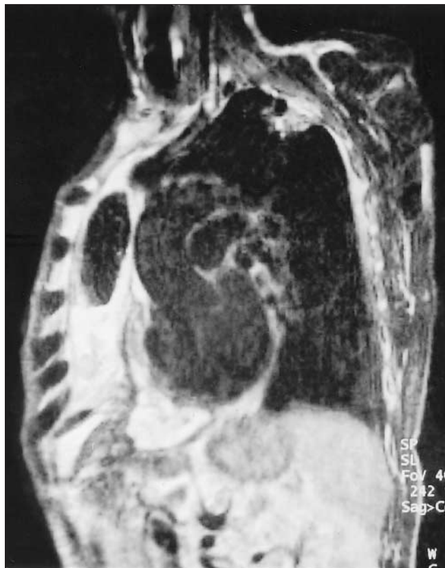
FIG. 4. MRI of a pericardial (but extrapulmonary) hydatid cyst.