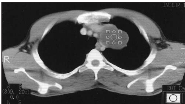
FIG. 2. The CT appearance of a mediastinal hydatid cyst.