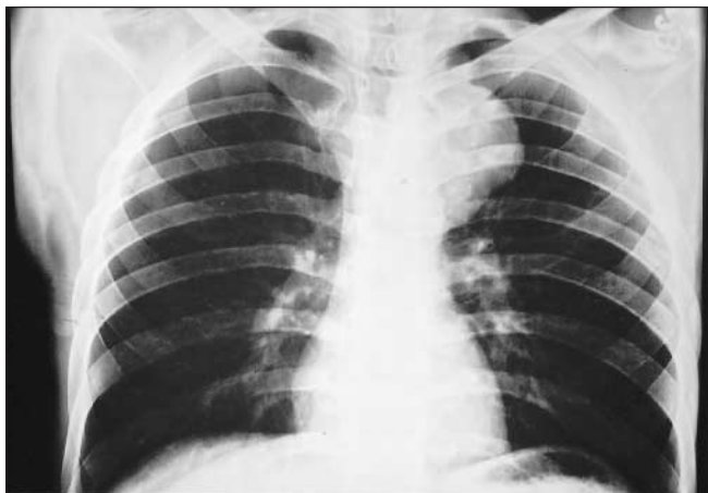
FIG. 1. Chest radiograph showing a hydatid cyst located in the mediastinum.

cysts should be suspected whenever another organ is involved with hydatid cysts. We use posteroanterior and lateral radiography, ultrasonography,