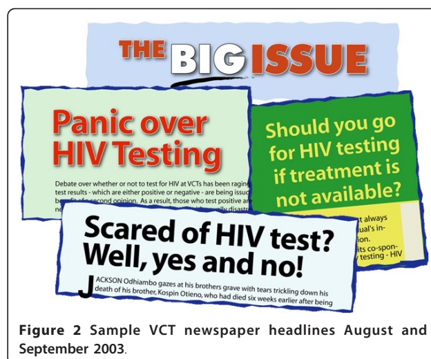
Figure 2 Sample VCT newspaper headlines August and September 2003.

Despite this the conflict was barely noticed outside Nairobi. In fact some of the district and provincial interviewees thought the bad publicity may have stimulated