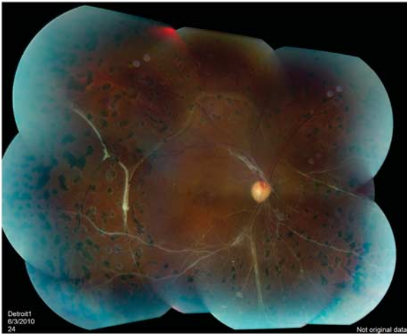
Figure 2 Right eye color photograph 4 months postvitrectomy. The retina is fully attached with islands of segmented preretinal fibrosis. Bands of subretinal fibrosis are seen temporal to the macula. Inferior macula and disk are ischemic and atrophic, as they were presurgically, with visual acuity of 6/18.