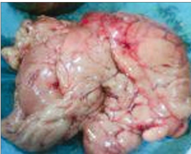
Figure 3: The lipoma weighing 1.7 kg

detected incidentally as an intraperitoneal radiolucent fat density mass, on a CT scan. Ultrasonography may present a confusing picture in some cases of retroperitoneal lipoma. Two cases of histologically proven giant retroperitoneal lipomas, evaluated by CT and sonography, appear to be similar on CT, but they exhibit different echographic patterns sonographically. [7] Whether the lipoma is congenital in infants is uncertain, as abdominal masses are not seen at birth in most cases, [4] but the presence of a huge abdominal mass in early infancy, in this patient, indicates that this retroperitoneal lipoma is most probably congenital. The lipoma may be too small at birth to be recognized. The