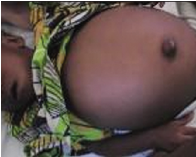
Figure 1: Gross abdominal distention due to retroperitoneal lipoma