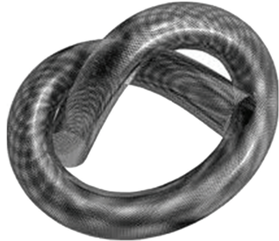
FIGURE 2: Pipeline embolization device (EV3 Inc.).

Similarly to conventional stenting, patients receive dual antiplatelet therapy (clopidogrel and aspirin) to prevent stent thrombosis prior to the procedure and for at least six months after the procedure.