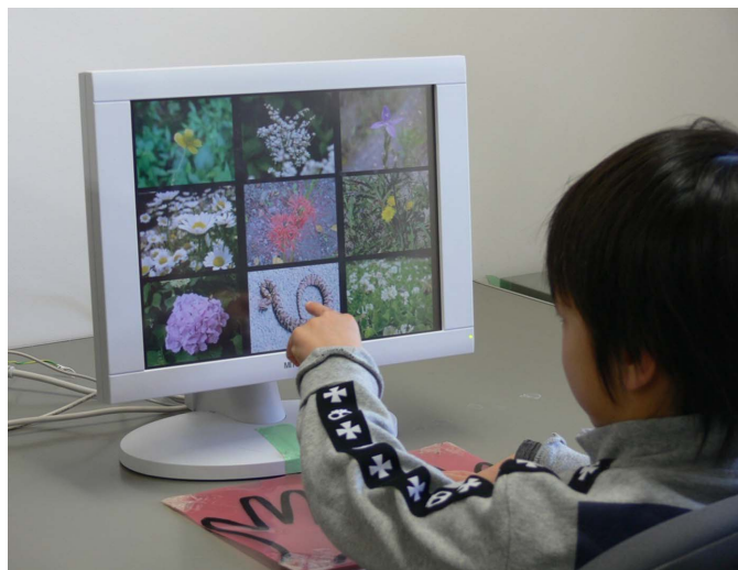
Figure 3 | A participant. A photo of a preschool child identifying the single snake target among 8 flower distracters by touching the snake image on a touch-screen monitor.

results were solely based upon analyses on the RT data collected in this manner (RTs of incorrect responses as well as extreme RT scores—defined as values more than 2 standard deviations above or below the mean relative to each participant's mean RT—were excluded from the analyses).