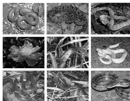
Figure 2 | Examples of a matrix with 9 pictures. Left 2 panels show the color-scale matrix and right 2 panels show the gray-scale matrix. Each display consisted of 1 target (a snake or a flower) and 8 distracter (the other) pictures.