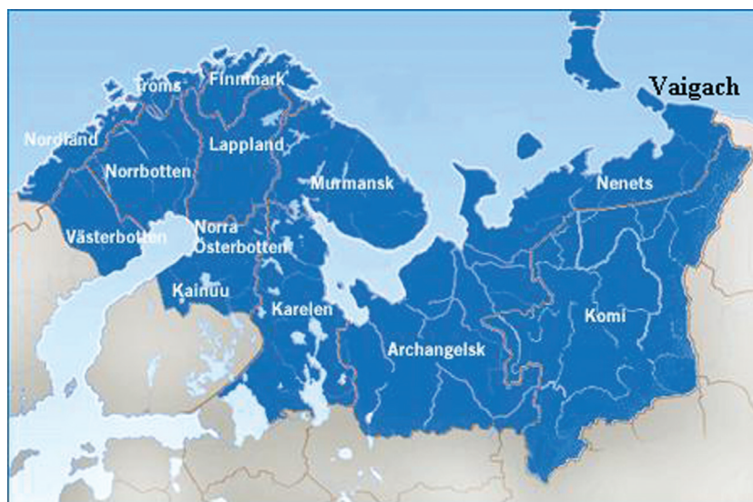
Map. Vaigach on the map of the Barents Euro-Arctic Region

The presence of tundra, the large numbers of marine animals (seals, walrus), and birds (geese) have shaped the features of the traditional economic system of the Nenets living on Vaigach.