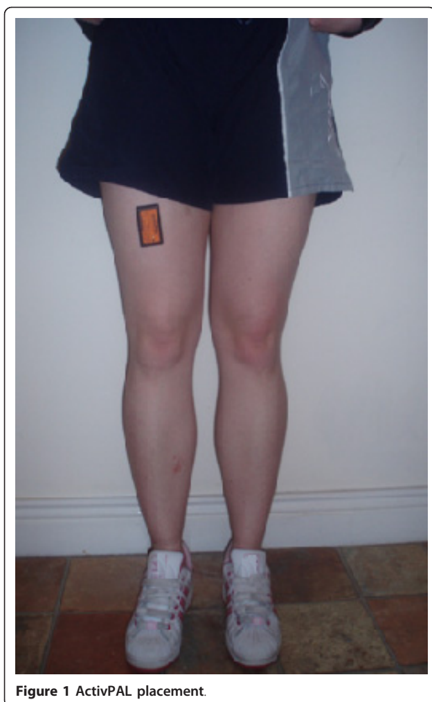
Figure 1 ActivPAL placement.

available for the Actigraph, was needed. As time spent sitting/lying can produce counts (for example when fidgeting or when moving lightly while sleeping) it was decided that extended periods of continuous zero counts produced while in the posture of sitting/lying would reflect non-wear time. Therefore, non-wear time was defined as 60 minutes or more of continuous unbroken 0 counts from the output data file. When this time was identified, it was omitted and the 24-hour day adjusted accordingly. Total hours spent sitting/lying and standing over the full 24-hour monitoring period was summed directly from the ActivPAL daily and weekly output for each participant. Sedentary levels were also expressed as the total and percent amount of time spent sedentary during the full 24 hours (which included time spent lying while sleeping).