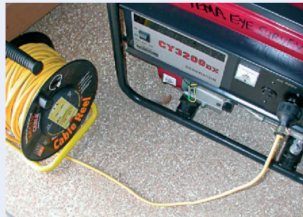
Figure 1. Connecting the cable reel to the generator. Note: unroll the cable reel before you plug the voltage regulator into the cable reel socket