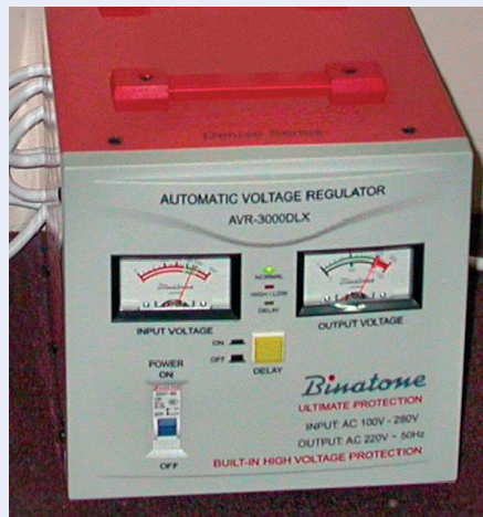
Figure 2. Voltage regulator