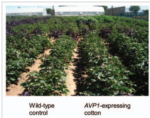
Figure 2. Wild-type and AVPI -expressing cotton plants grown in the dryland field condition. Plants were planted in the middle of May 2009 and the picture was taken in the middle of July 2009 at the USDA Experimental Farm in Lubbock, Texas.

The larger root systems of AVPI -expressing cotton plants under saline and water-deficit conditions allow transgenic plants access to more of the soil profile and available soil water resulting in increased biomass production and yield. Li et al. showed that the larger root systems of AVPI -overexpressing Arabidopsis is caused by increased auxin polar transport in the root, which stimulates root development in AVPI -overexpressing Arabidopsis plants. 10 Furthermore, a recent comparative study of transgenic Arabidopsis lines that produce enlarged leaves showed that auxin levels were increased by 50% in AVPI -overexpressing plants. 11 To test if altered auxin level is responsible for the observed