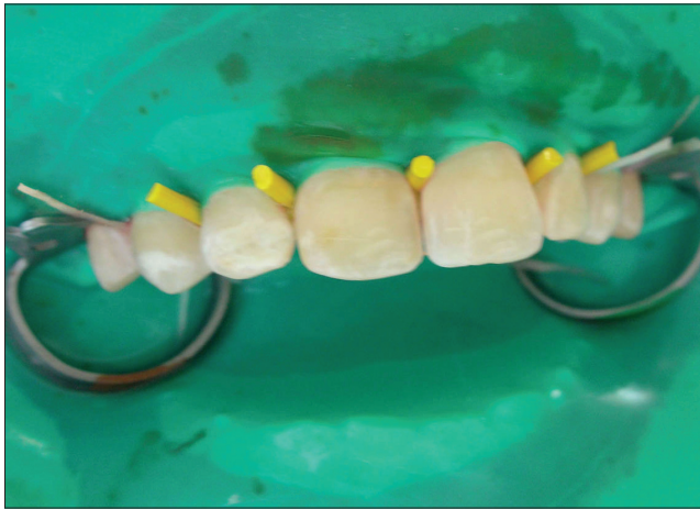
Figure 3: Note the color change immediately after completion of microabrasion