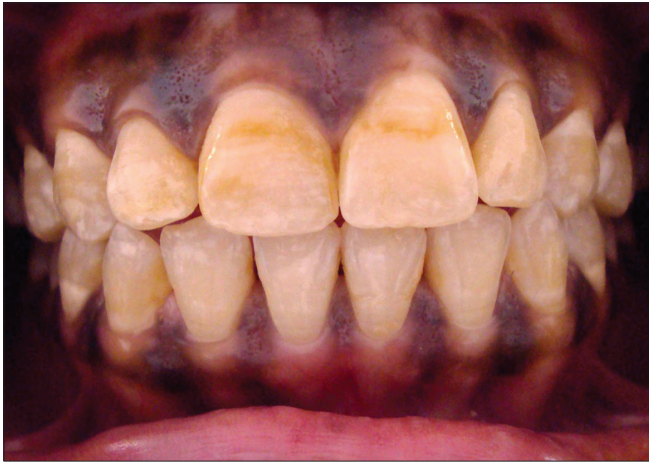
Figure 1: Preoperative view showing yellowish discoloration on labial aspect of both central incisors and chalky labial surface of all teeth