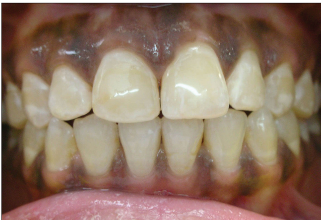
Figure 5: Completion of finishing and polishing procedure. Note the high luster obtained producing camouflage effect and masking the white chalky patches