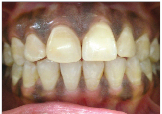
Figure 6: One month follow-up visit showing constancy of esthetics achieved after treatment