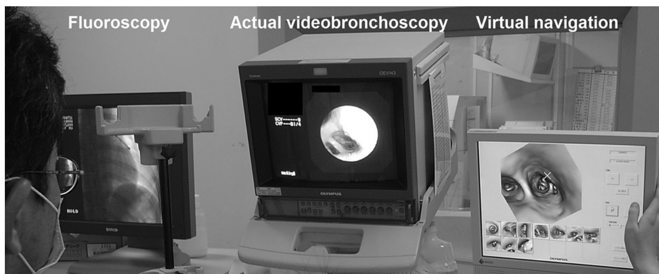
Figure 1 Virtual bronchoscopic navigation. An assistant physician controls virtual bronchoscopic images of the path leading to a peripheral lesion and a bronchoscopist inserts an endoscope as instructed.

Bronchoscopic insertion was assisted using the VBN system in the VBNA group. The bronchoscope was introduced into the bronchus of the NVBNA group without VBN support and with reference only to CT axial images. Lesions were visualised in both groups by inserting a 20 MHz mechanical radial-type EBUS probe (external diameter, 1.4 mm; UM-S20-17S; Olympus Medical Systems) with a guide sheath (K-201; Olympus Medical