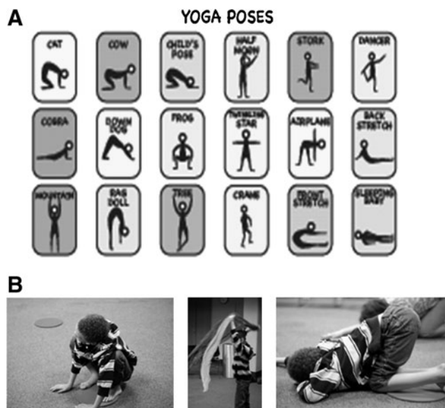
FIG. 1. A. The diagrams used in program to guide the children in learning the yoga poses. B. One of the study participants engaging in some of the yoga and dance movements.

When all subjects were considered, of the three BASC-2 composite clinical scales (BSI, Externalizing, and Internalizing), only the BSI showed improvement (compare row 1 to