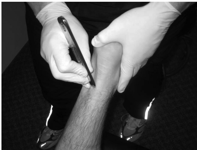
Figure 2 Graston Technique ® performed on the Achilles tendon.