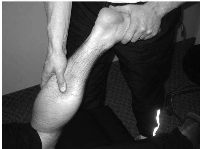
Figure 3 Active Release Techniques ® performed on the gastrocnemius muscle.

Figure 3) applied to the affected muscles of the posterior leg (gastrocnemius, soleus, plantaris, flexor digitorum, tibialis posterior, and flexor hallucis longus). Slow eccentric calf lowering exercises (see Figure 4) were performed after the soft tissue mobilizations utilizing the sets and repetitions prescription consistent with previously published protocols. 17-22 Finally, static gastrocnemius and soleus stretching was utilized in conjunction with ice pack application (see Figure 5). The patient was also required to follow a specific protocol of home therapy which included ice application, calf stretching, and eccentric heel lowering exercises (See Table 2). The patient was instructed to maintain his current level of physical activity, but not to increase it. During re-evaluation on the sixth visit, the pain level was reduced to 3–4 out of 10 (a 50% improvement), and Achilles discomfort was experienced less often in the mornings, as well as during and after running. Upon conclusion of the plan of management, the patient reported minimal discomfort in the Achilles tendons when squeezing or rubbing them, little to no discomfort with running, no pain with activities of daily living, and a pain level of 0–1 out of 10. Resisted plantar flexion and passive ankle dorsiflexion was non-painful. The patient considered the condition to be almost completely resolved and was thus discharged with instructions to continue with the home therapy protocol for