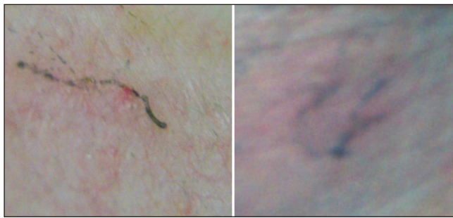
Figure 1 Two examples of the burrow ink test. The underside of a fountain pen is rubbed on the skin and excess ink is wiped off with an alcohol swab. The burrow is visible as a wavy line where the ink has filled the tunnel in the stratum corneum

diagnosis. A simple and often overlooked bedside test is the 'burrow ink test' (BIT), in which fountain pen ink is gently rubbed on a suspicious site. Excess ink is wiped off with an alcohol swab, making the burrow visible as a wavy ink-filled line in the stratum corneum where the mite has tunnelled. We use the BIT in our outpatient infectious diseases clinic to successfully diagnose infections (Figure 1). A published case series (10) reported that the best place to find a lesion was on the medial aspect of the hypothenar area of the hands and wrists.