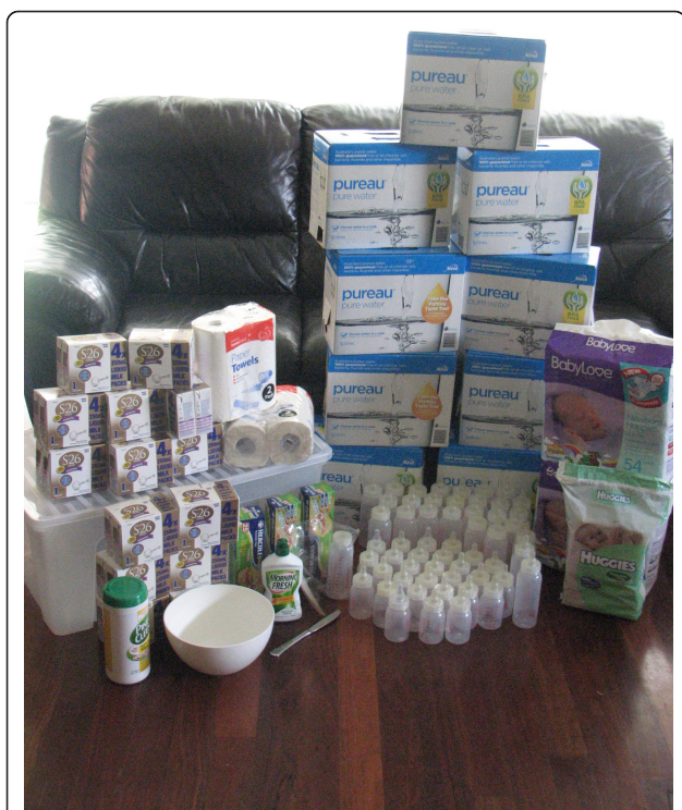
Figure 2 Emergency supplies required to fully formula feed using ready-to-use infant formula.