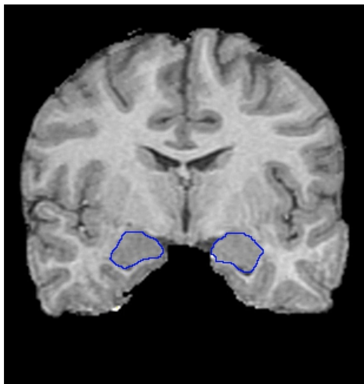
Figure 1. Outline of the left and right amygdalae on the positionally normalized brain stack in coronal orientation. The most superior white matter tract extending from the temporal lobe marked the inferior border, CSF marked the medial border, endorhinal sulcus marked the superior border, and a thick, central white matter tract of the temporal lobe was used as the lateral border of amygdala.