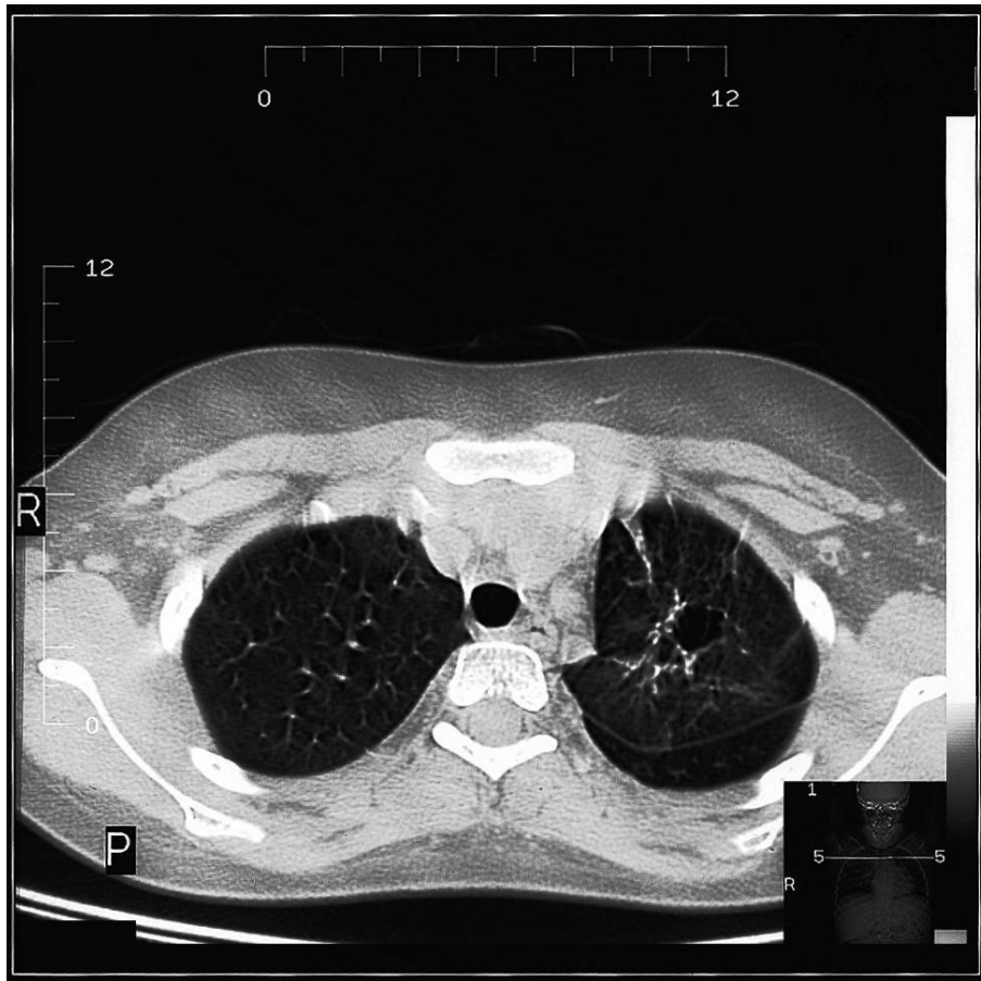
Figure 1 Fine nodules, interstitial infiltrations and a cystic lesion on chest high-resolution computed tomography (HRCT) in a child with HIES.

of them experienced pathological bone fractures. Interestingly, decreased bone mineral density is not a predisposing factor for the pathological fractures. Grimbacher et al [34] showed diminished bone density in a group of five out of nine patients, in whom densitometry was carried out, yet pathological bone fractures occurred in two patients with abnormal results of this examination and in three patients with normal bone mineral density. It has been suggested that osteopenia may result from excessive bone resorption caused by monocytes and activity of prostaglandin E2 [55]; moreover, cytokine profile in the hyper-IgE syndrome influences bone resorption, similar to women in the postmenopausal period [56]. Minegishi et al demonstrated that osteoclasts from HIES patients with STAT3 mutations show higher bone resorption activity compared with those from control subjects [57]. More than 60% of affected individuals present with scoliosis of varying degrees of severity and of different origin. This may be a result of different longitudinal dimension of the lower limbs, of thoracotomy for the purpose of removing pneumatocele,