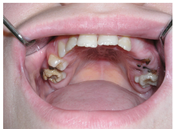
Figure 4 Maxillary teeth with severely damaged primary teeth due to caries as well as carious cavities within permanent dentition in a child with HIES.