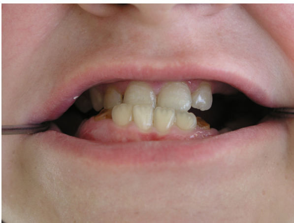
Figure 3 Prognathism in a child with HIES.