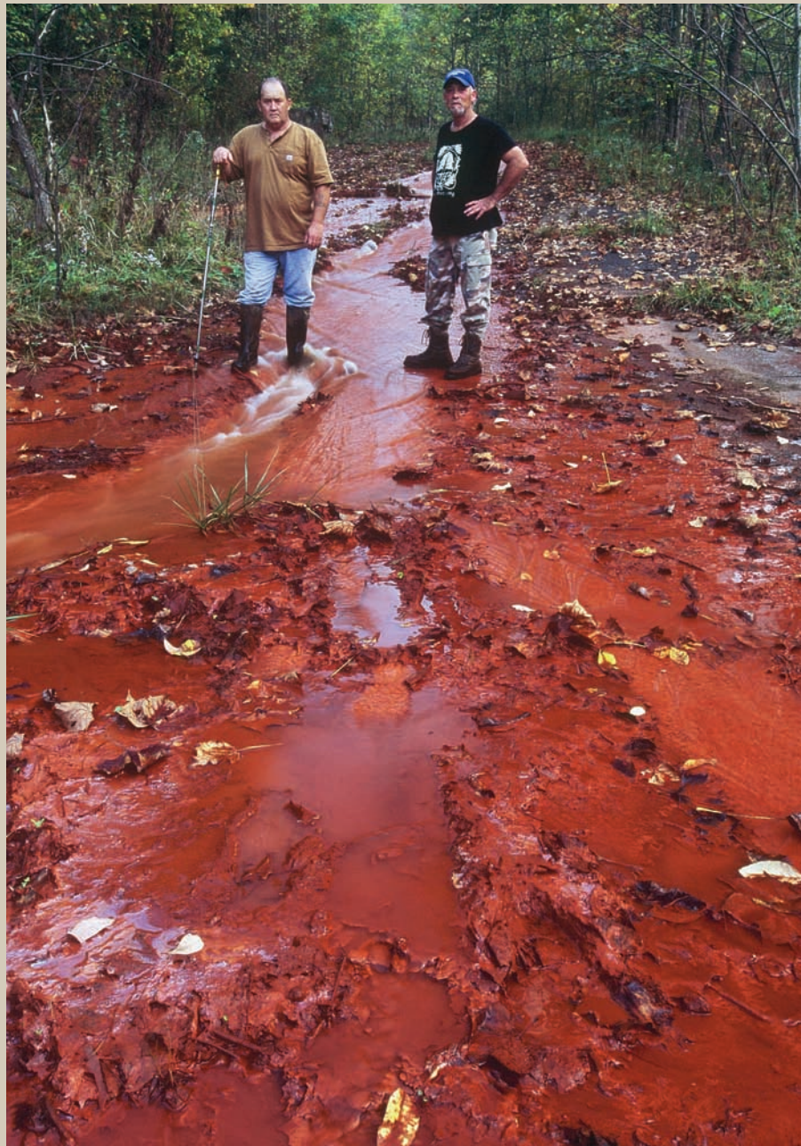
Metal-rich runoff pools below the mine site at Kayford Mountain, about 35 miles southeast of Charleston, West Virginia. Contaminated drinking water is one of the chief health concerns for communities surrounding MTR mining operations, although definitive links to reported health problems have not been established in these populations.

Potential impacts from coal dust exposure include cardiovascular and lung disease, and possibly cancer. “That’s based on what we have observed in studies of general population outcomes for people that live in the mining areas,” Hendryx says. “This is also consistent with research by other investigators that has documented the environmental impacts of mining.” 11 However, again, tests of health outcomes related to coal dust exposure have not been conducted in these populations.