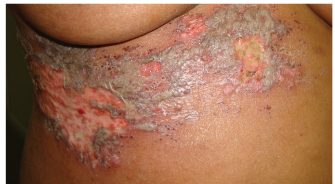
Figure 1 - Grouped erythematous vesiculous and crusted herpes zoster lesions on the right thoracic region along the intercostal nerve path.

The patient was treated with intravenous acyclovir for seven days, with marked improvement of the lesions. She started therapy with AZT + lamivudine + abacavir. At the same time, the cervical oncotic cytology was suggestive of