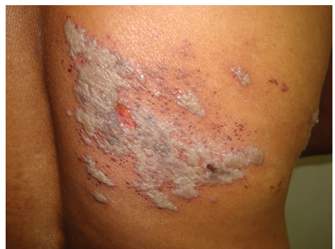
Figure 2 - Grouped erythematous vesiculous and crusted herpes zoster lesions on the right thoracic region along the intercostal nerve path – back view.

cervical intraepithelial neoplasia I (CIN I) and infection with human papillomavirus (HPV). Colposcopy suggested CIN I, and the cytological samples from the cervix after 3, 6, 12, and 18 months were normal. A hypochromic scar remained in the affected area after the herpes zoster was treated (Figures 3A and B), which caused constraints on the