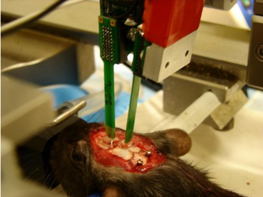
Figure 2. Example of experiment with silicon probes inserted in the prefrontal cortex and hippocampus. Drops of PBS cover the craniotomy to protect the exposed brain from drying. Two screws located over the cerebellum will be connected to ground and reference, respectively.