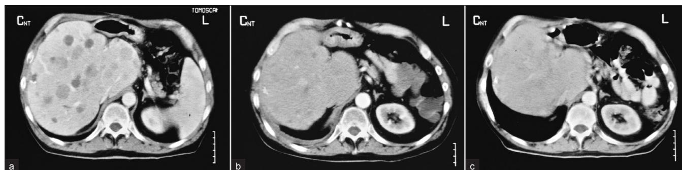
Figure 2: Liver computed tomography images of patient no. 3 with multiple liver metastases: prior to (a), after 9.3 GBq of 90 Y-DOTATOC (b) and after 6 months follow-up (c) with response to the liver metastases