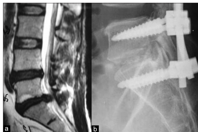
Figure 2: (a) T2W sagittal MRI of lumbosacral spine showing L5-S1 prolapsed intervertebral disc. (b) X-ray of lumbar spine (lateral view) showing grade 2 fusion, after instrumented laminectomy bone chip PLIF