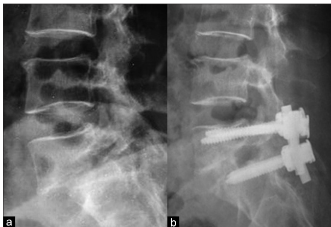
Figure 1: (a) Preoperative X-ray of lumbar spine (lateral view) showing Grade 2 lytic listhesis. (b) X-ray lumbosacral spine (lateral view) showing grade 1 fusion after instrumented laminectomy bone chip PLIF