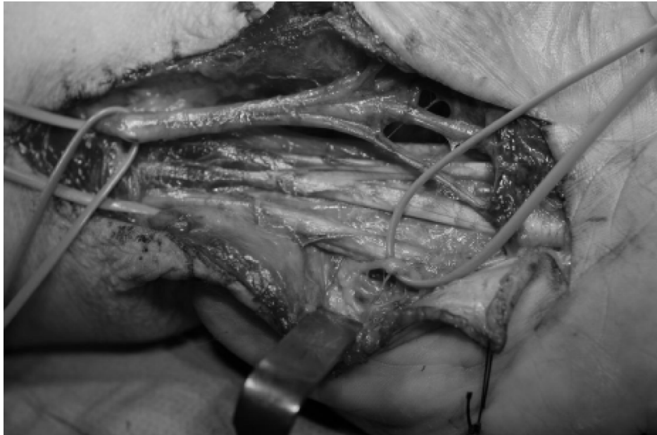
Figure 4 The flexor tendons and the median and ulnar nerves are identified and protected.

the correct diagnosis in 94% of cases [1]. The tumors lie in close approximation to important neurovascular structures and tendons, which makes the operation very demanding.