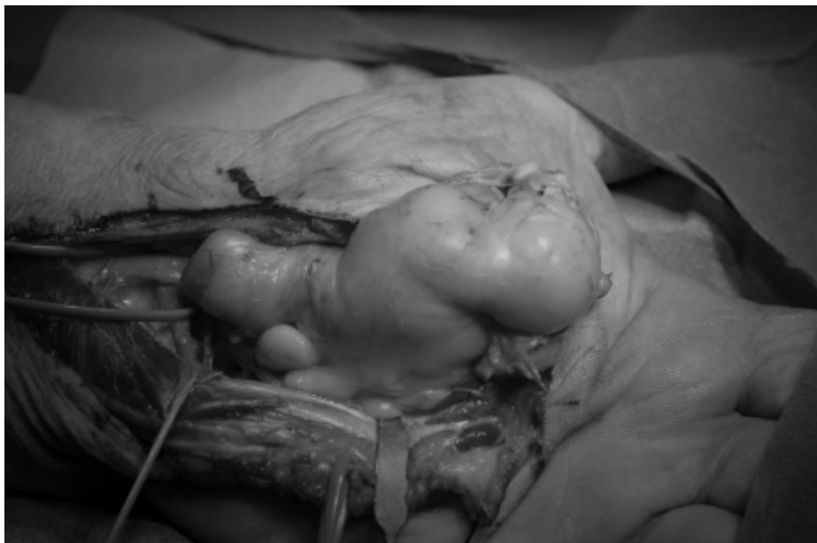
Figure 3 The lipoma was excised en block.