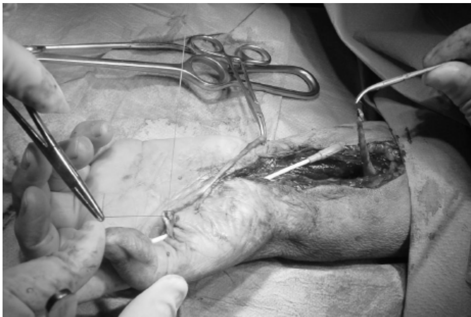
Figure 5 Reconstruction of the Flexor Pollicis Longus tendon with an intercalated autograft of Palmaris Longus tendon.

The need for a thorough clinical examination and a sound intra-operative investigation of all anatomical structures involved in the carpal tunnel release operation is of paramount importance. Although treating physicians may consider this type of operation a simple one, a high suspicion index concerning tissue involvement in