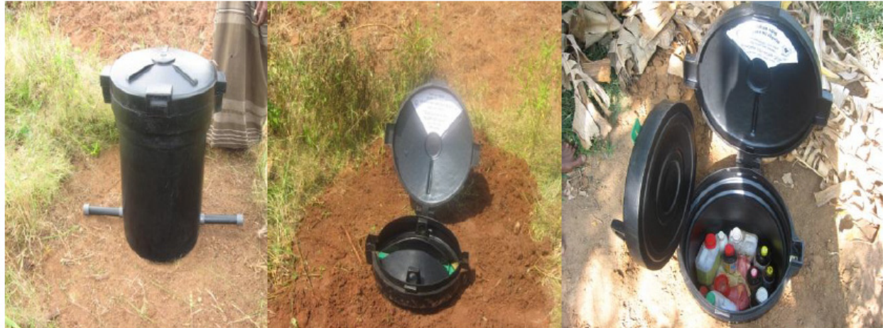
Figure 3 Safe storage device for agrochemicals in Sri Lanka. The UV-resistant plastic pesticide storage container to be used in this study. A) Device before installation: the metal bar at the base secures the device from theft. B) Device buried with two lids to protect the padlock from weather damage. C) Device can store several large and small bottles of pesticides.

pesticide self-poisoning, both fatal and non-fatal, amongst villagers aged 14 years or older, over the three-year study period. Secondary outcomes will include the incidence of: pesticide poisoning in general (deliberate and accidental, all ages), self-harm (all methods, both fatal and non-fatal), self-poisoning (all substances) and pesticide poisoning in children (younger than 14 years).