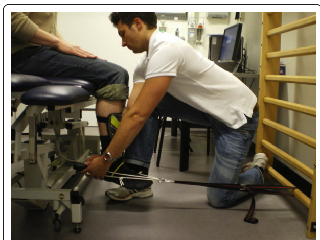
Figure 3 Clinical assessment of muscular isometric knee flexion strength using a modified hand-held dynamometer.

When analyzing this study's reliability using the SEM and SDD, high measurement error was indicated. Previous studies evaluating HHD, in contrast, have demonstrated only low to moderate measurement error in terms of SEM and SDD [14,22]. These studies, however, were performed on other populations and used non-modified HHD [14,22]. Results of the current study would, therefore, be more comparable with a study by