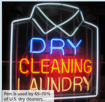
Perc is used by 65–70% of U.S. dry cleaners.

A new study finds that the solvent perchloroethylene, or "perc," can accumulate in dry-cleaned clothes over repeated cleanings, building