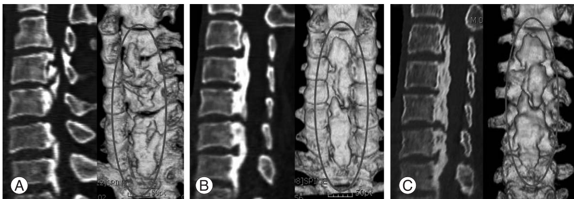
Fig. 1. (A) The sagittal computerized tomography scan of 66-year-old male patient showed mixed type ossification of the posterior longitudinal ligament (OPLL). (B) Follow up computed tomography scan of two years after laminoplasty. OPLL mass grew the most 2 years after surgery. (C) Five years after surgery, there showed mild increase of the OPLL mass than post-operative 2 years finding, but the difference was minimal compared with first 2 years.

After directly removing OPLL in anterior aspect, or floating the OPLL mass from the surrounding bone tissues, the involved segments are fused. When the pathologic focus is