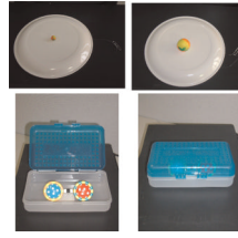
FIGURE 1. Examples of fine motor assessment apparatus, including small pellet, large pellet, and box task.