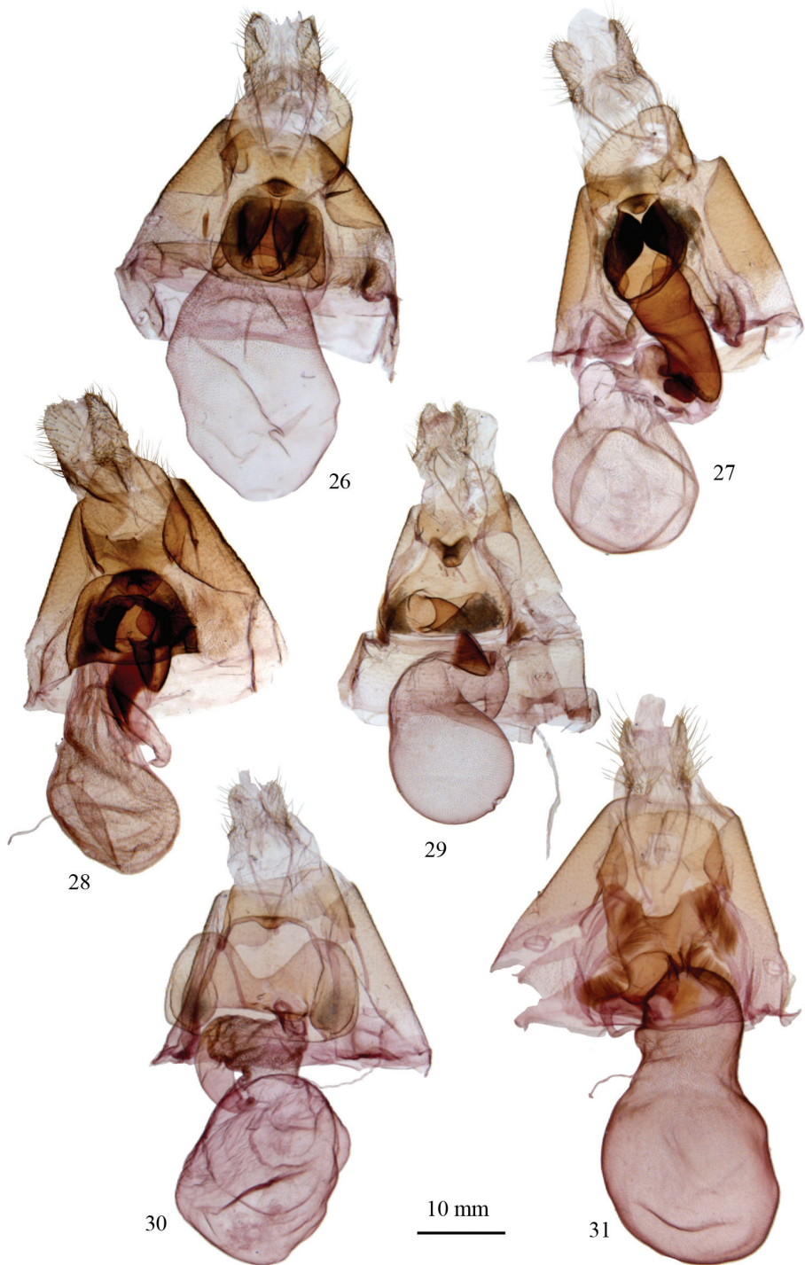
Figures 26–31. Female genitalia of Argyrostrotis . 26 A. flavistriaria 27 A. sylvarum 28 A. erasa 29 A. deleta 30 A. quadrifilaris 31 A. anilis .