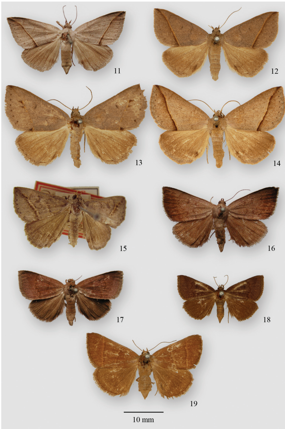
Figures 11–19. Type material of Argyrostromis 11 Poaphila perplexa lectotype, MNHN 12 Poaphila perspicua holotype, BMNH 13 Mocis? diffundens holotype, BMNH 14 Phurys glans syntype, BMNH 15 Phurys carolina lectotype, AMNH 16 Poaphila erasa lectotype, MNHN 17 Poaphila deleta lectotype, MNHN 18 Poaphila placata syntype, BMNH 19 Poaphila obsoleta syntype, BMNH.