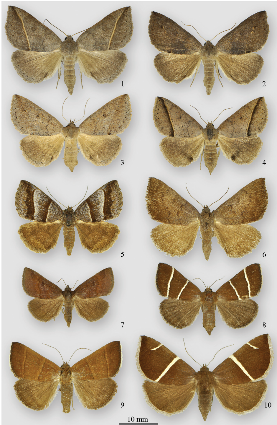
Figures 1–10. Argyrostrotis adults 1–4 A. flavistriaria 5 A. sylvarum 6 A. erasa 7 A. deleta 8, 9 A. quadrifilaris 10 A. anilis .