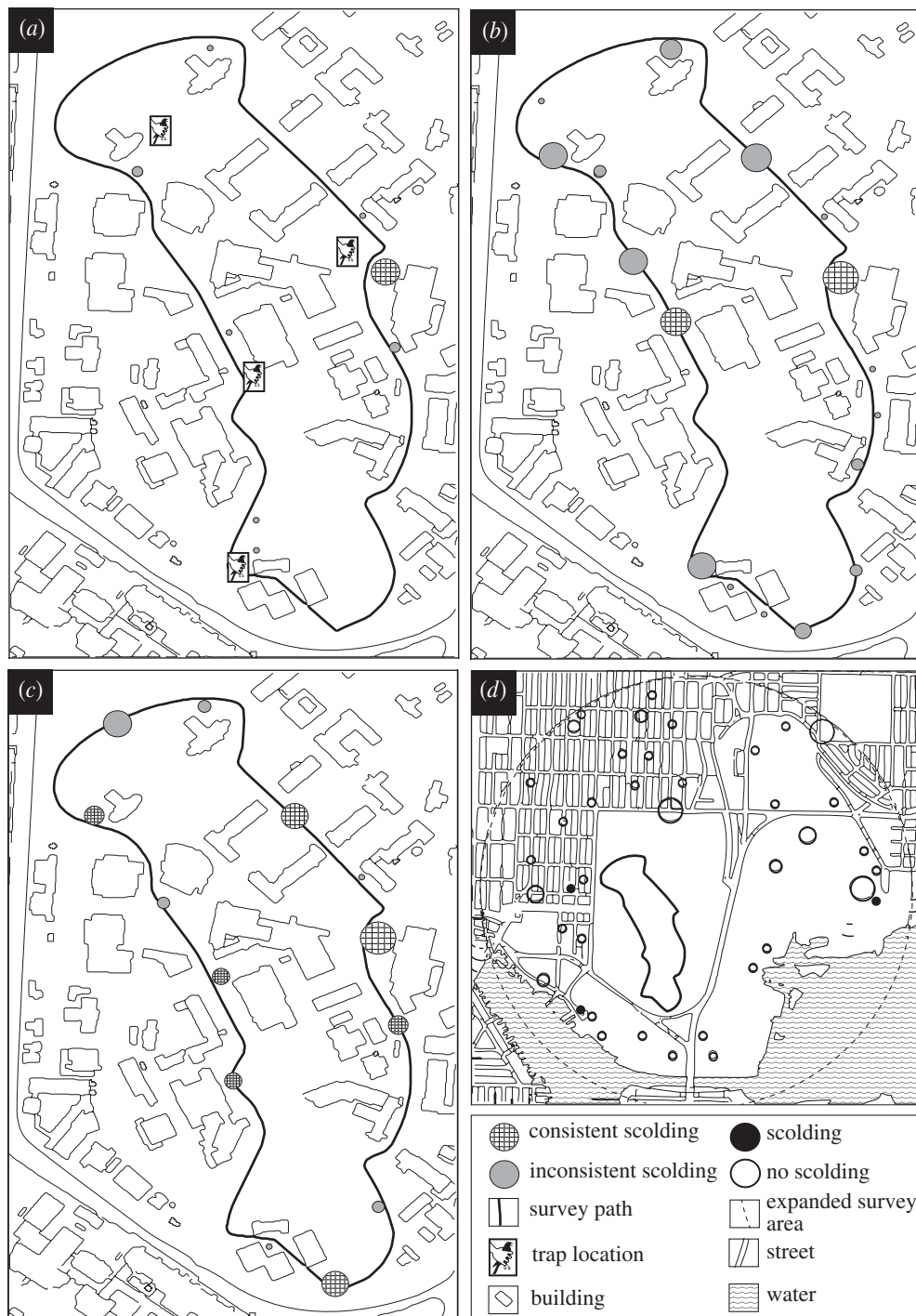
Figure 3. Spatial increase in intensity and extent of scolding at the UW site. Locations of consistent (cross hatched circles) and inconsistent (filled circles) scolding to the dangerous mask from (a) two weeks, (b) 1.25 years and (c) 2.8 years post-trapping. Circle diameter is proportional to the number of scolding crows: smallest circles represent single crows; largest represent groups of seven crows. Solid line marks survey route. (d) Responses with scolding (filled circles) and no scolding (open circles) during the expanded search (large dashed circle superimposed on street network) carried out 2.7 years after trapping.

— After trapping, during our experiments, crows that did not have a direct, negative experience with the mask associated with other crows that were captured by a person wearing the dangerous mask. Scolding vocalizations directed at the dangerous mask typically (82% of 126 scolding events) attracted a mob of crows who scolded the masked person. Mob size averaged 6.4 crows (range 2–21, n = 103 ) and included both crows previously captured and those not previously captured by masked people. Most of these birds were not trapped by us while we wore the dangerous mask; 86.9 per cent