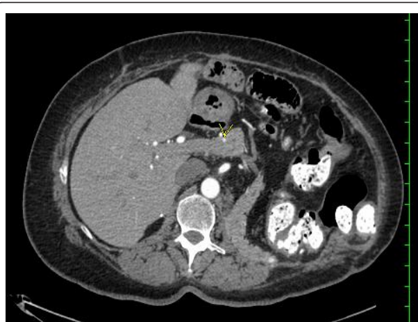
Figure 1 Radiological evaluation. A computed tomography of the chest and abdomen demonstrated multiple small enhancing nodules throughout the pancreas.

examined without any signs of malignancies. At last follow-up in November 2011, she remains in good physical conditions and tumor free.