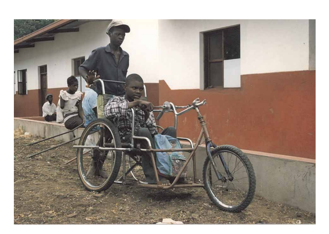
Figure 1 Hand-cycle wheelchair in Mozambique. A young man with paraplegia had to stop attending school after the chain in the arm cycle broke, and replacement parts were unavailable.

Prescribed equipment needs to be practical, durable, and reparable; ideally by the injured individual or family. If self-repair of equipment is not practical, the injured individual should have an identified local resource to access for equipment-related issues, otherwise it is not uncommon for still-useful equipment to be discarded. Individuals and local communities often devise their own adaptive aids and mobility devices from available resources (Fig. 1). Wheelchairs are particularly problematic, as designs utilized in developed nations are typically not appropriate for rugged, unpaved rural environments.<sup>7</sup> In the aftermath of the 2010 Haiti earthquake, wheelchairs were successfully dispensed that were specifically designed for such environments (e.g. RoughRider wheelchair, Whirlwind Wheelchair International, San Francisco, CA, USA).<sup>18</sup> Technology-intensive equipment can be prone to