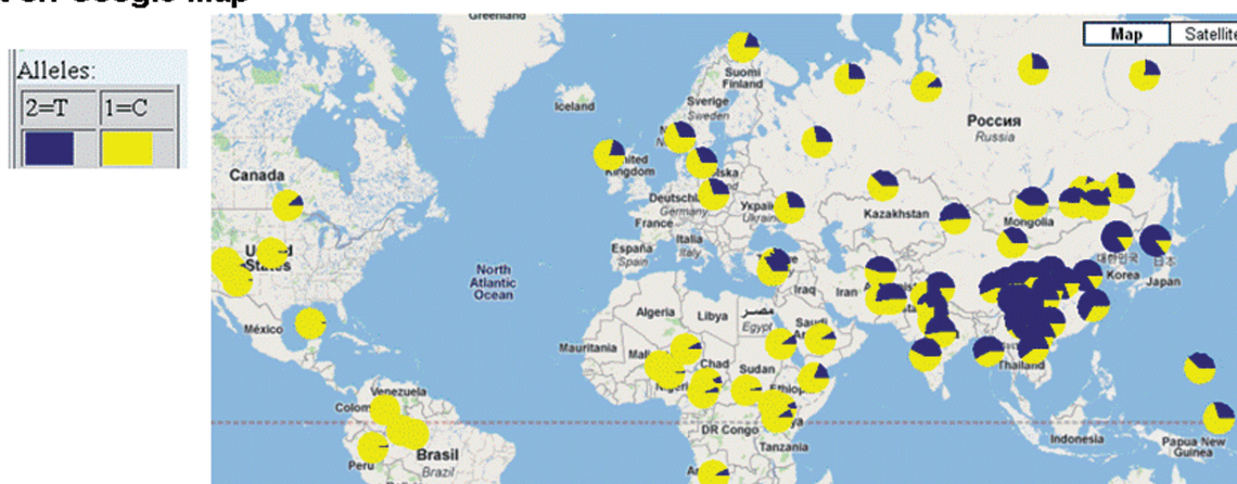
Figure 2. Different allele frequency display formats for rs2066701 of ADH1B gene.

annotating ALFRED populations. ALFRED curators are responsible for comparing between different wiki update versions and adding relevant information to the population descriptions in ALFRED. We invite ALFRED users to participate in this effort of population annotation. Users are required to create an account and log in to be able to edit the ALFRED wiki pages. Contact us using our feedback function on the ALFRED home page to create an account.